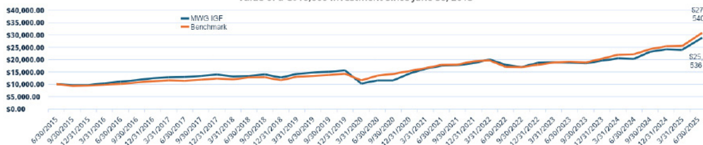
MWG Income Growth Fund - Series F Value of a C$10,000 Investment Since June 30, 2015